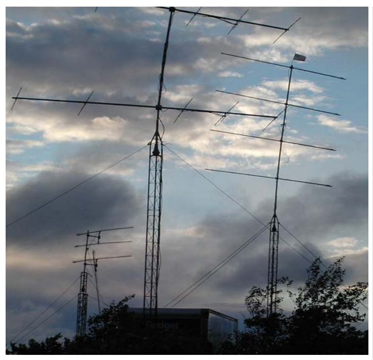
And the Wind did blow but by the dawn's earlt light the towers stood with only one slight injury to the 1296 array—fixed and "ON THE AIR" (notice the leaning of the masts)