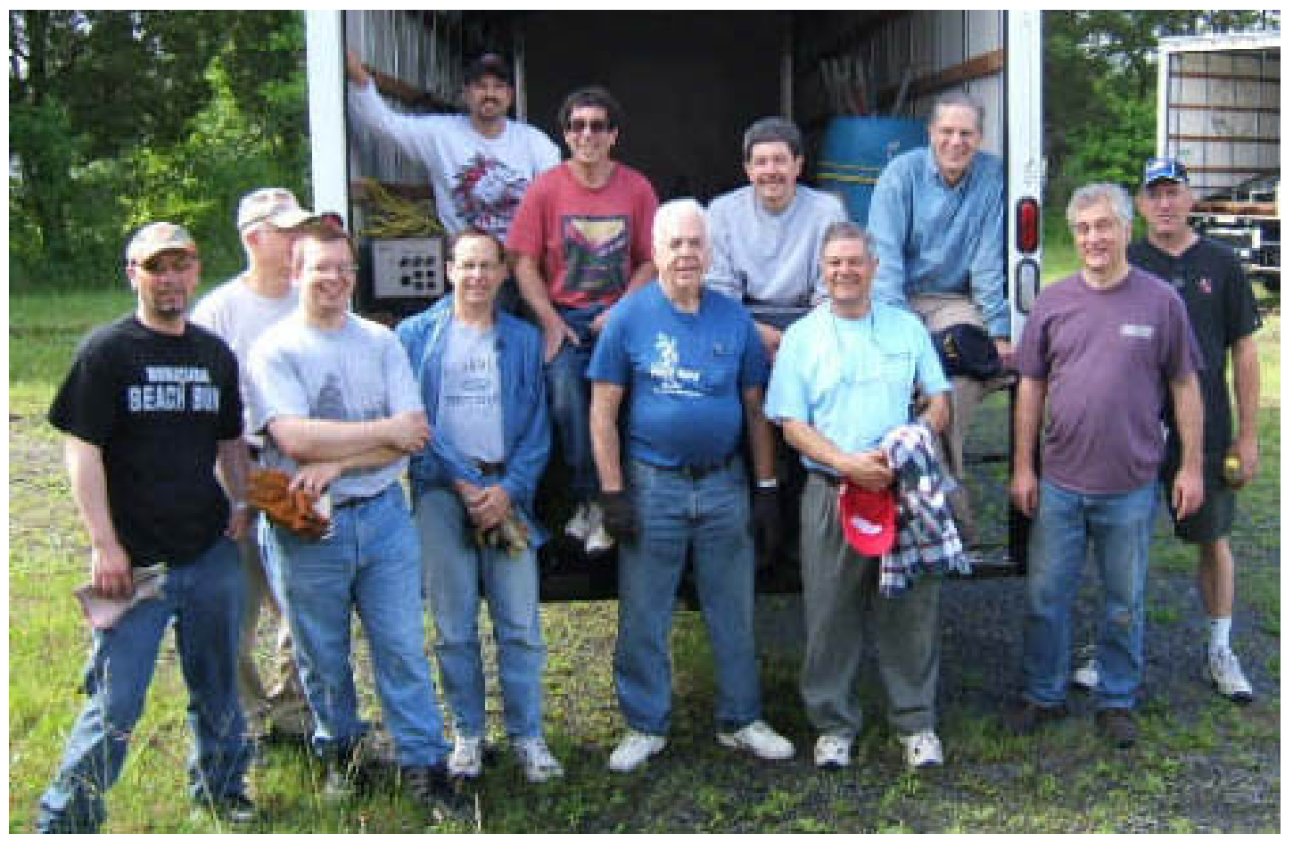
OFF to a great beginning with this terrific crew for loading Friday morning at W3GXB's Barn

Despite wind gusts of near 50 miles per hour the towers stood and the RF flew along the 'E'- Skip on 6 and 2 meter, the rovers, roved all over the north country and the PACKRATS under the leadership pf KF5AJ and N3ITT stood forth for their best ever performance from CAMEL BACK MOUNTAIN.