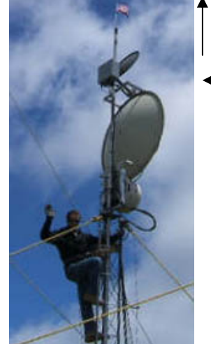
ABOVE: W2PED and WA3RLT work on one of the towers on the ground .

W2PED also spend more time up on the towers doing minor adjustments and final installation work on the microwave gear despite the wind the flag is straight and just flapping a bit in the ever present wind on the hill.