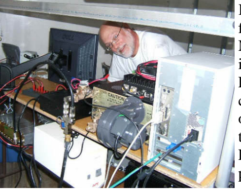
K3TUF is having fun with the 222 MHz "Wireless" installation. From here you can see the serious blower used to cool the the LUNARLINK power amp.